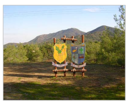
Visit to the Church and religious exhibition - Kornos Scout Centre

DESMOS COMMITTEE MEMBERS ARE GRATEFUL TO THE CYPRUS SCOUT ASSOCIATION FOR WARM HOSPITALITY AND WONDERFUL TIME IN CYPRUS!