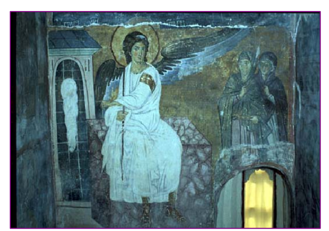
The famous fresco "White Angel"