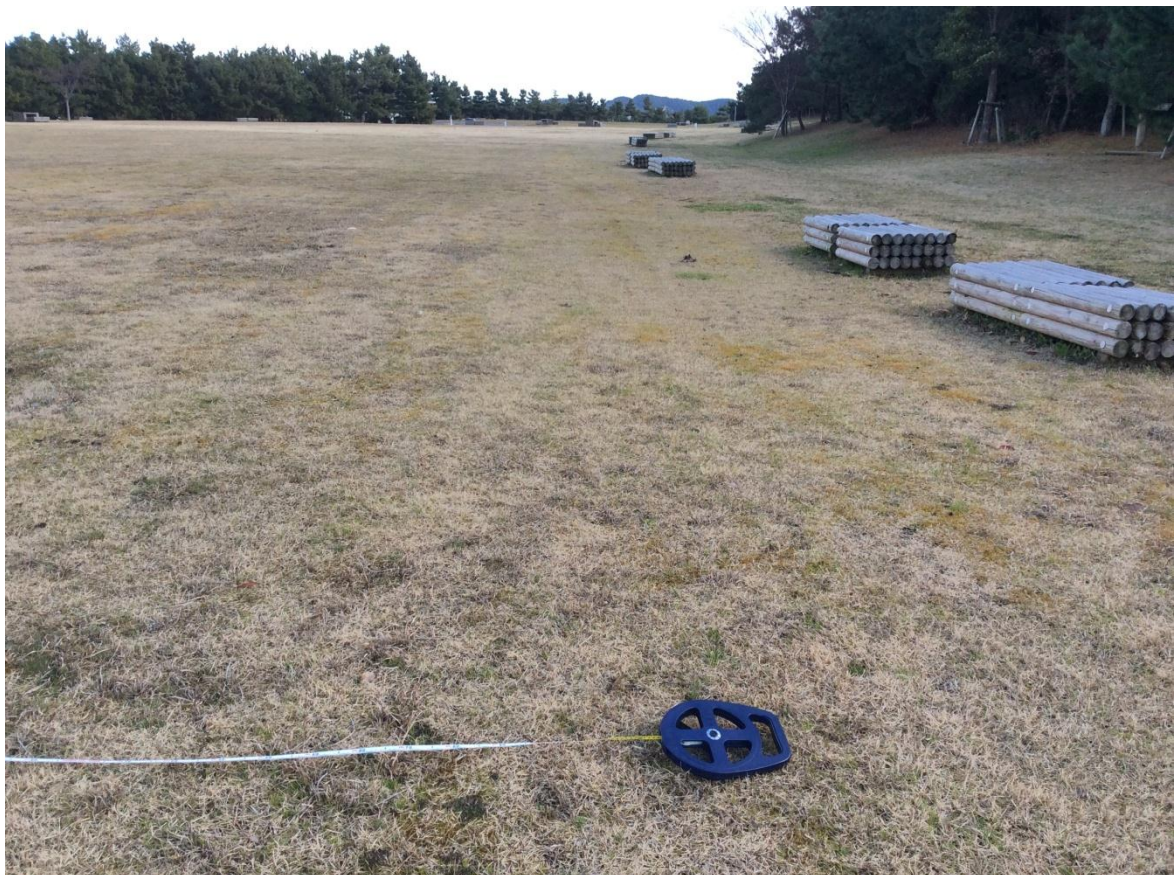
The width of the site is 50 metres at this point from the trees on the opposite side.