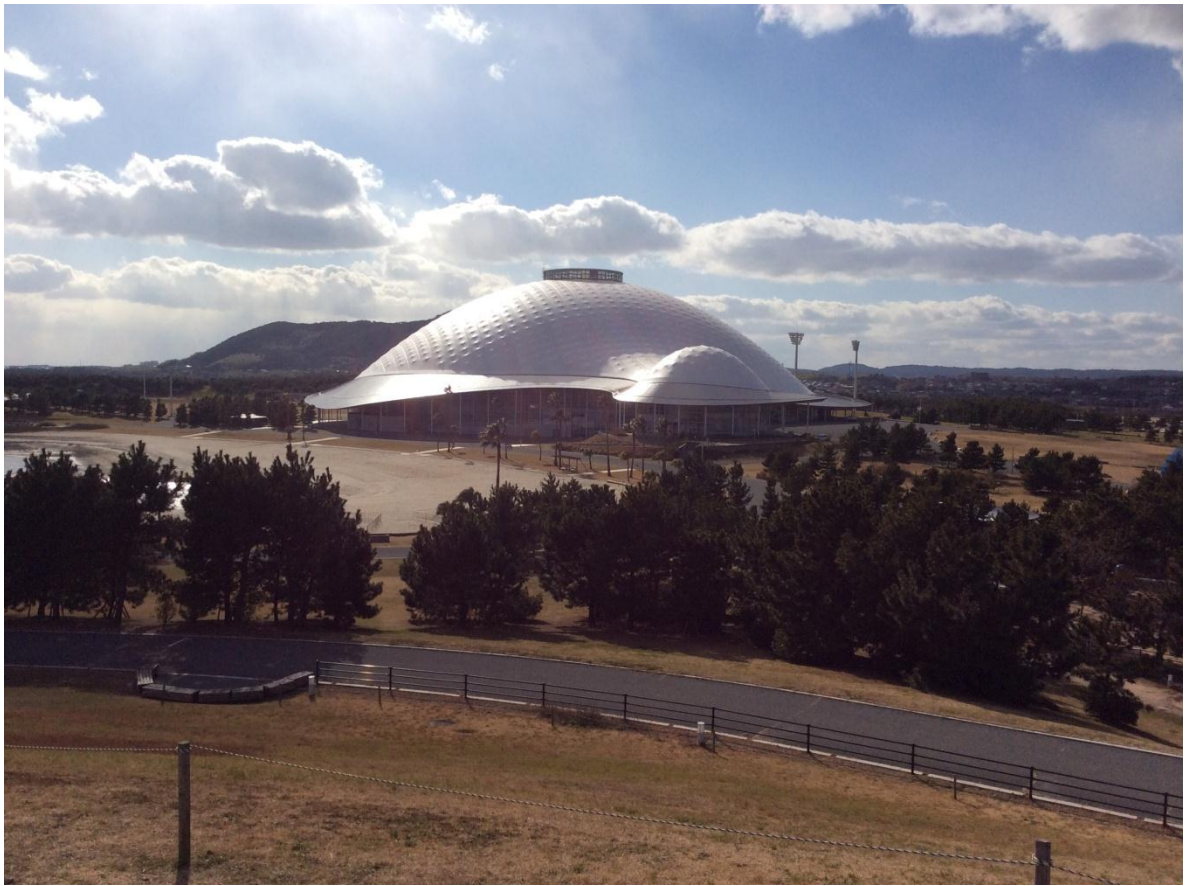
The Dome from the highest point at the Jamboree