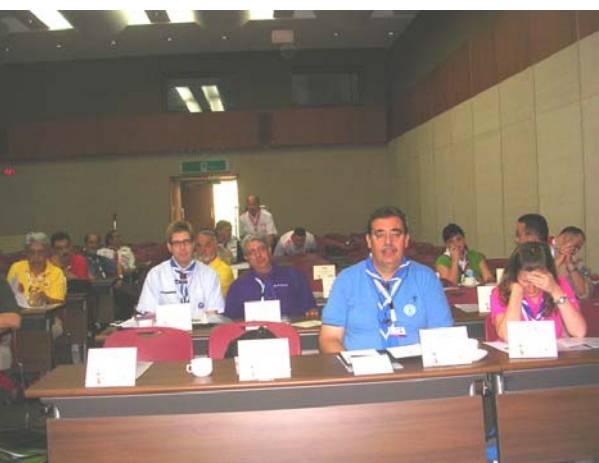
The 5<sup>th</sup> Desmos Conference was closed the same day around 20h30.

More details can be found in the Minutes of the 5th DESMOS Conference, available at the Desmos web site, in the segment Resource Materials/Desmos Documents.